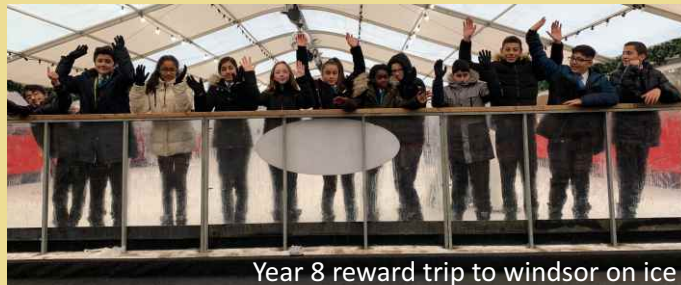
Year 8 reward trip to Windsor on ice