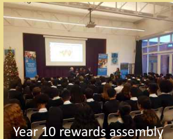
Year 10 rewards assembly