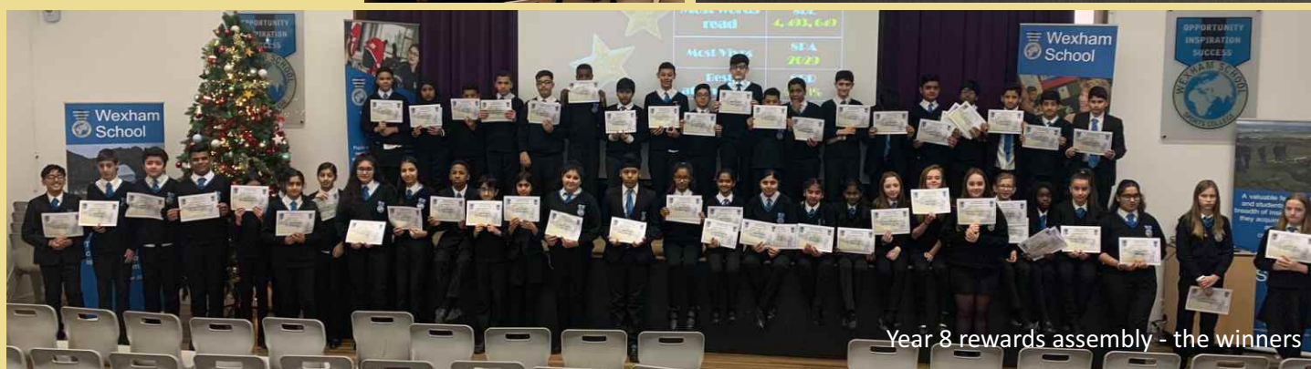
Year 8 rewards assembly - the winners