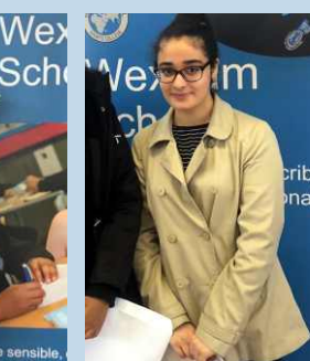
1 C grade. Off to read Law at Reading Uni