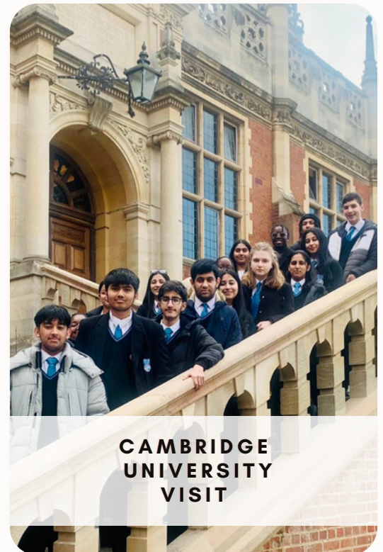
CAMBRIDGE UNIVERSITY VISIT