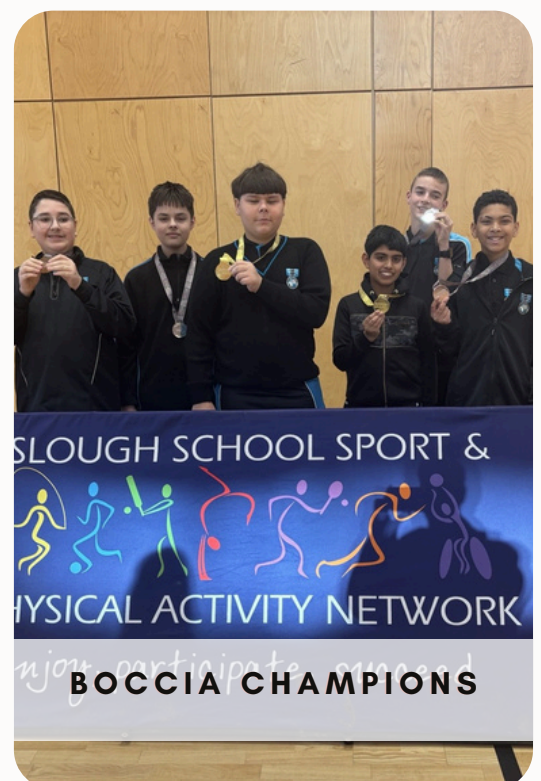
SLOUGH SCHOOL SPORT & PHYSICAL ACTIVITY NETWORK enjoy participate succeed BOCCIA CHAMPIONS